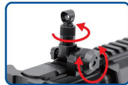
Windage knob (left / right adjustment) Elevation knob (up / down adjustment)