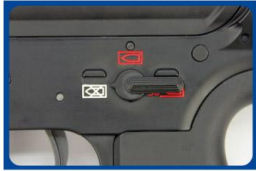
Safety On The gun will not fire