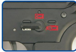
Full Auto Automatic firing