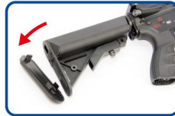
Pull out the butt plate from the upper part.