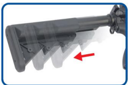
Adjust the position ( 6 position ).