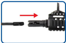
Return the hop up dial to normal position and insert the cleaning rod from the lead edge of the inner barrel.