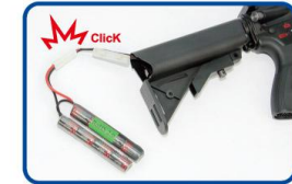
Connects the battery until connector clicks into place.