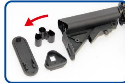
Take out the battery stop.