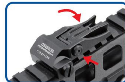
Front Sight - Press the button and Fold down