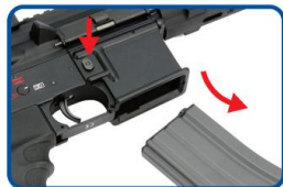
Remove the magazine.