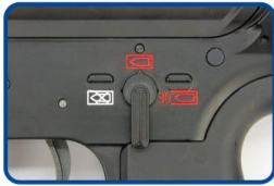
Semi Auto Single shot