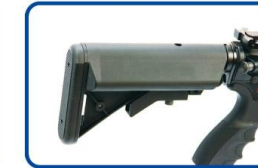
Reinstall the battery cover and butt plate.