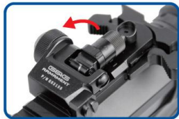
Rear Sight - Flip up