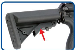
Press the stock release lever to unlock.