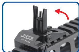
Front Sight - Flip up