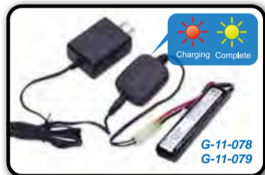
1. Charge up the battery. 2. Charging will be completed after 3 hours.