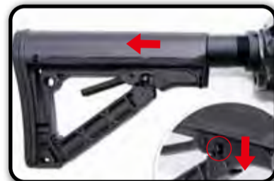
Remove the stock to install battery by pulling down levers on the side as shown in the graphic.