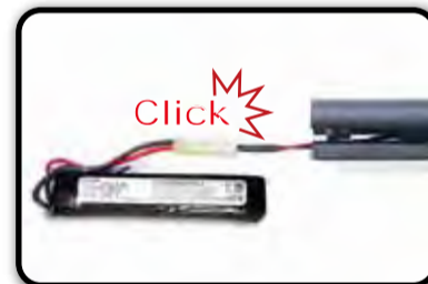
Install battery until it click into place.