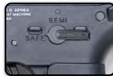
SAFETY ON The trigger cannot be pulled