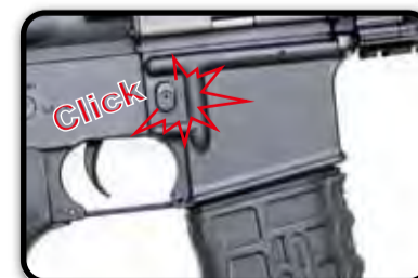
Insert the magazine until you heard a click sound.