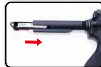
Insert the battery into stock.