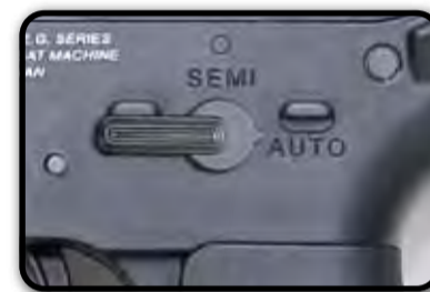
FULL AUTO Automatic firing