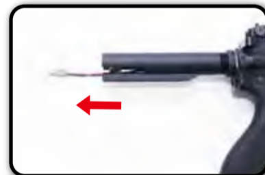
Find the connector in the stock tube.