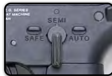
SEMI AUTO Single shot